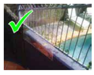
A flat polycarbonate sheet can be used to shield a climbable object.